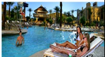
Actual photo from Southpoint.

Reserve your room by May 8th to receive a rate of just $60/night!